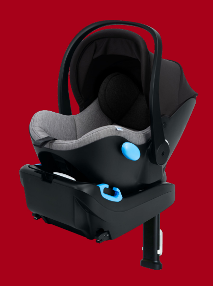
Liing Rear-Facing Only