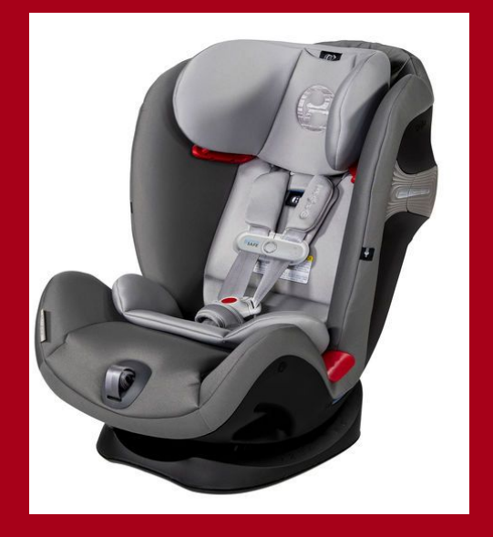
Eternis S All-in-One