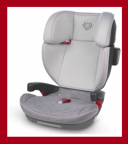
Alta Highback Booster